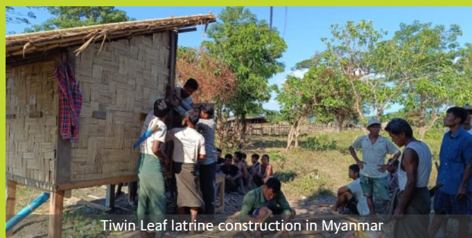
Twin Leaf latrine construction in Myanmar