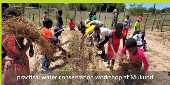
practical water conservation workshop at Mukundi

With your donation, you support the training of marginalized persons that enables them to run their own impact making organisations. Your donation has an impact over many years and reaches countless people in need around the world.