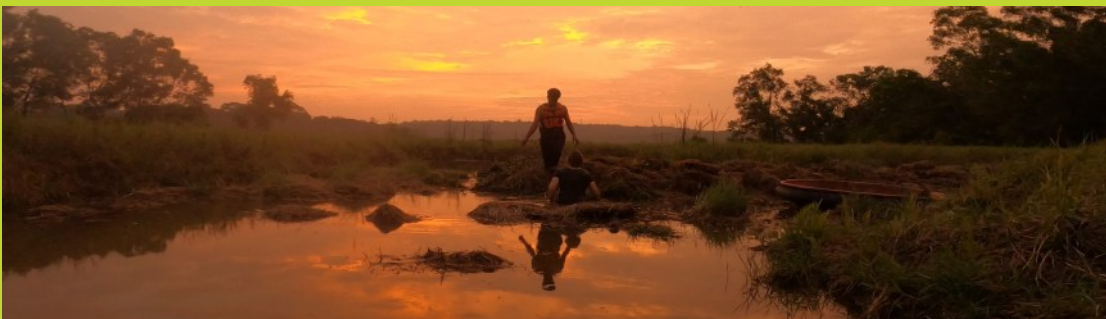
Left: Part of the JuMo Channel, created by Justus and Moris at sunset. Amidst a floating grassland they created a meandering canal. Mangroves and other trees here to create a unique water wonderland.