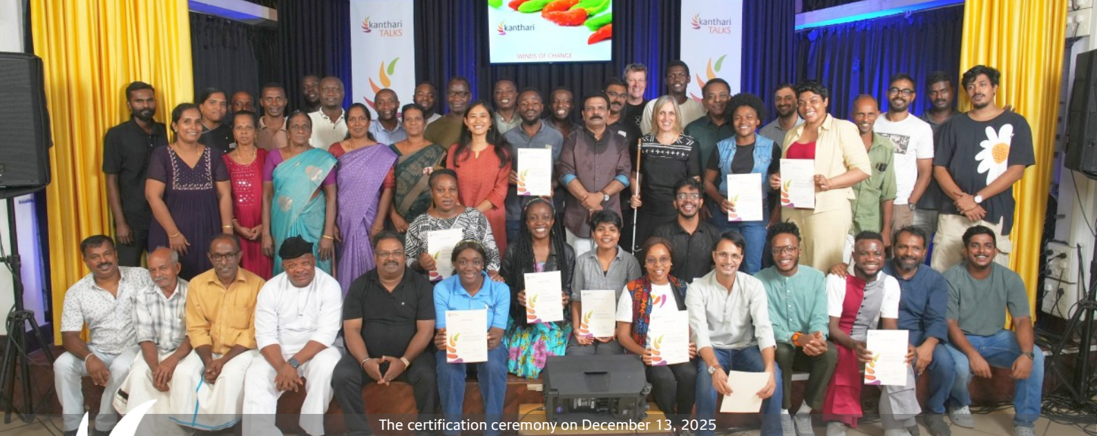
The certification ceremony on December 13, 2025