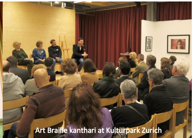
Art Braille kanthari at Kulturpark Zurich