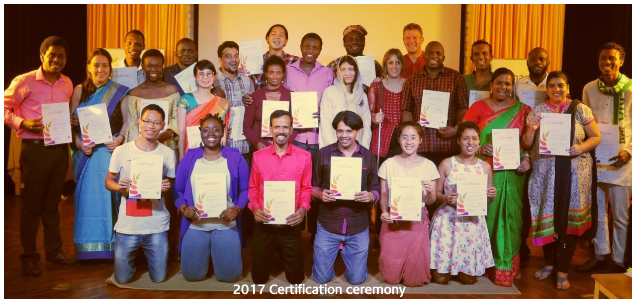
2017 Certification ceremony

Pre-event University College in Palayam, Trivandrum. The highlight of act four is the annual kanthari TALKS event. For the first time, kanthari TALKS was to be held in the heart of the city of Trivandrum. In order to reach out to society and to create awareness, a special Pre-event was organized at the University College in Palayam. Around 140 students from the National Service Scheme (NSS) wing of Kerala University college met with the participants at the kanthari campus. There the concept of the exhibition was planned. The Pre-event was held on the 17 th of November 2017 during which many students were reached.