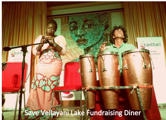
Save Vellayani Lake Fundraising Diner