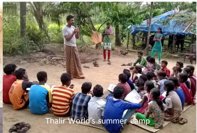
Thalir World's summer camp