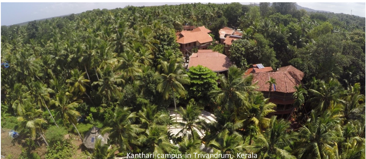
Kanthari campus in Trivandrum, Kerala

www.facebook.com/kantharis - www.kanthari.org