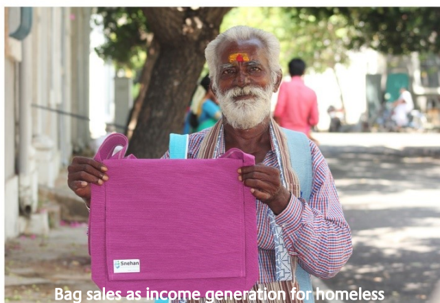
Bag sales as income generation for homeless