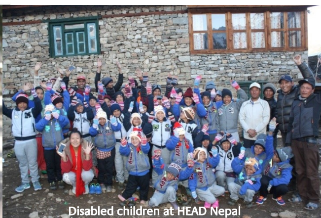
Disabled children at HEAD Nepal

disabilities that are enrolled in Thumbs Up Academy. "- Odwar Samuel - More at http://thumbsupuganda.org/