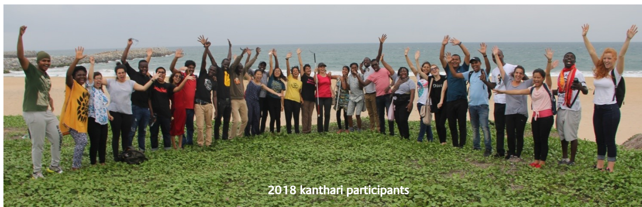
2018 kanthari participants

"Thumbs Up Uganda continues to strive against negative social-cultural behavior and increased marginalization. We are happy that an increasing number of children attend our Thumbs Up