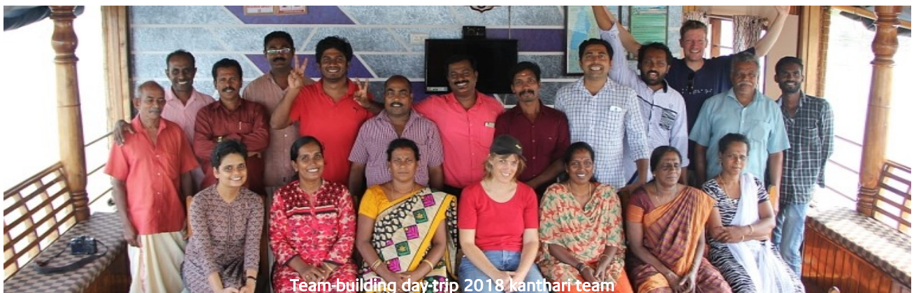
Team-building day-trip 2018 kanthari team

Do you want to support the work of kanthari? You can do this here – THANK YOU VERY MUCH! www.facebook.com/kantharis - www.kanthari.org