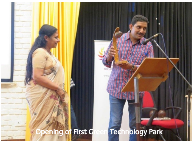
Opening of First Green Technology Park