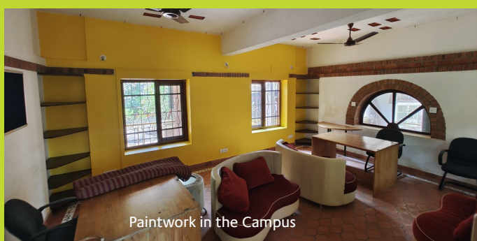
Paintwork in the Campus