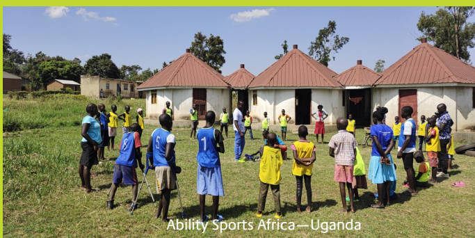
Ability Sports Africa—Uganda

In the meantime, our team had their hands full preparing the campus for the new generation. The academic block and the building with 18 dorm rooms have been