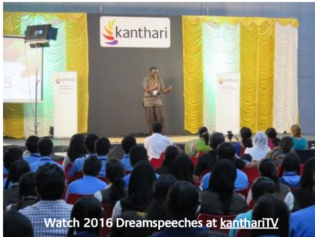
Watch 2016 Dreamspeeches at kanthariTV