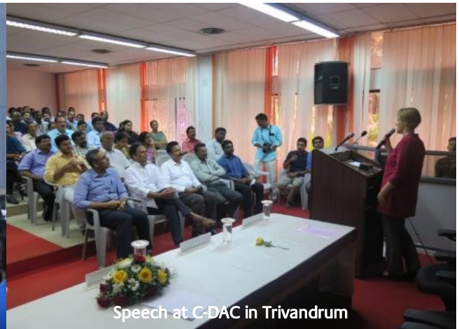
Speech at C-DAC in Trivandrum