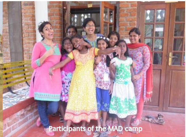
Participants of the MAD camp