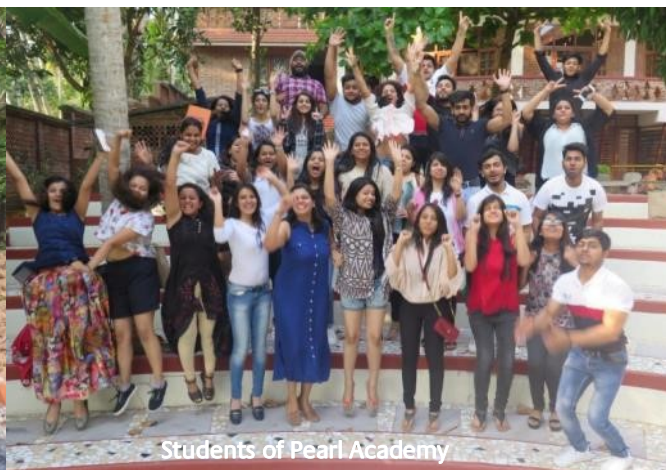
Students of Pearl Academy