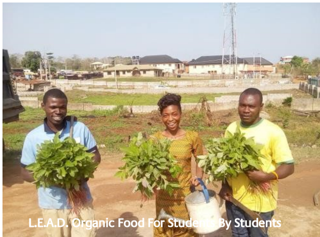
L.E.A.D. Organic Food For Students By Students