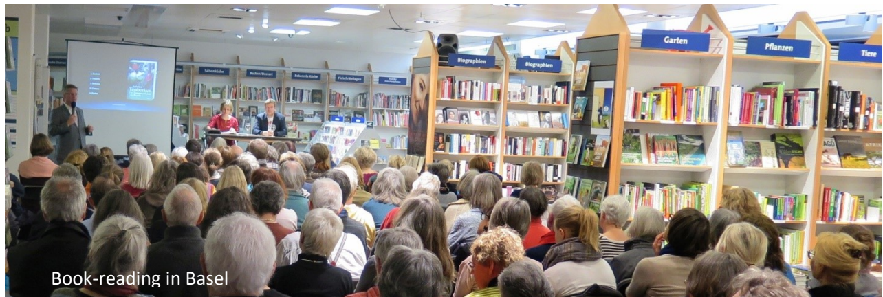
Book-reading in Basel

that is harvested is as clean as possible. A duck and fish farming pond was created. The roof of the office block was tiled with colored broken tiles. The leaking Ducts on the kitchen roof were repaired. New notice boards were placed in several locations and maintenance on the anti-ant water channels will prevent ants from entering our buildings. The campus is now ready for the eighth generation.