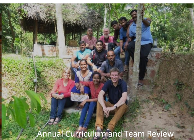
Annual Curriculum and Team Review