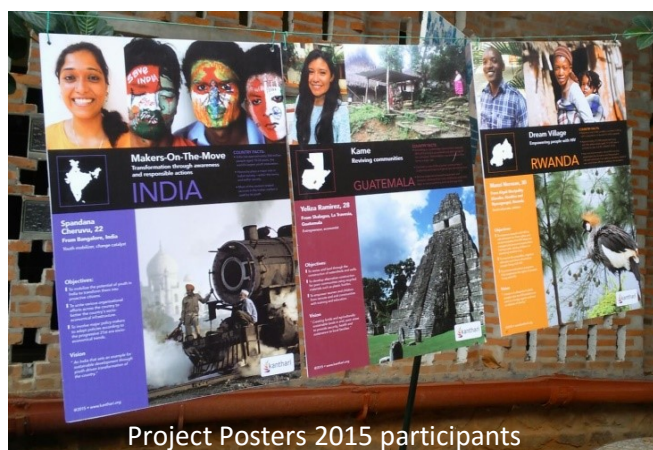
Project Posters 2015 participants

During the first three months of 2016 several maintenance activities were initiated and completed. The rainwater harvesting system got special filters that make sure that the water